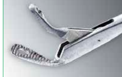
Sataloff Microlaryngeal Instrument Set: Right Heart-Shaped Grasper

MicroFrance instruments are a must-have in ENT and cervico-facial surgery, thanks to their commitment to innovative technology, quality, and reliability.