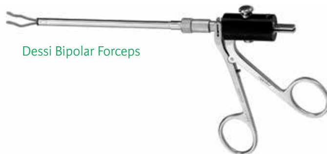
Dessi Bipolar Forceps

Dept. of Otorhinolaryngology – Head and Neck Surgery Groupe Hospitalier de la Timone Marseille, France